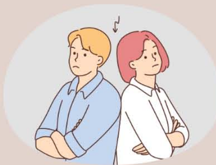
5. Unhealthy relationships