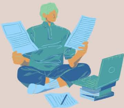
1. Studies and achievements