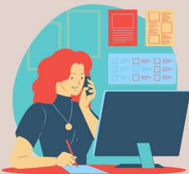
4. Career or Studies