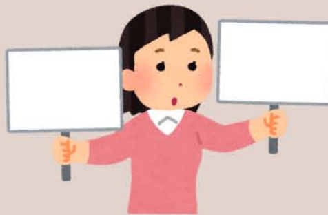
2. Self-comparison with peers