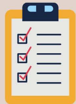
6. Unrealistic goals