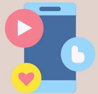
3. Comparing ourselves on social media