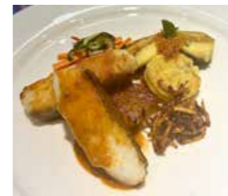
Juicy halibut fillet coated in a rich, aromatic percik sauce, served alongside crispy potato patties topped with savoury shredded chicken floss