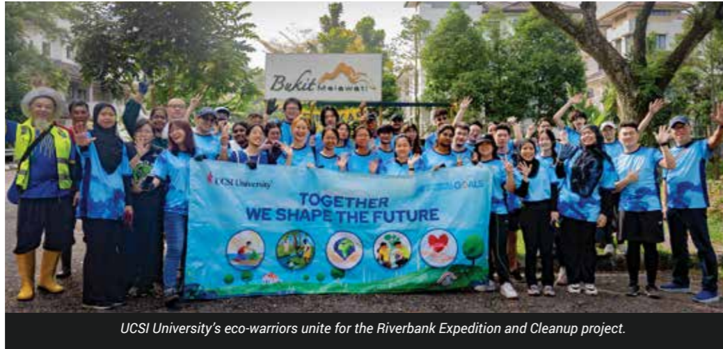
UCSI University's eco-warriors unite for the Riverbank Expedition and Cleanup project.

The visit is the first initiative of the UCSI Riverbank Cleanup Project - a continuous effort to galvanise eco-warriors across Malaysia.