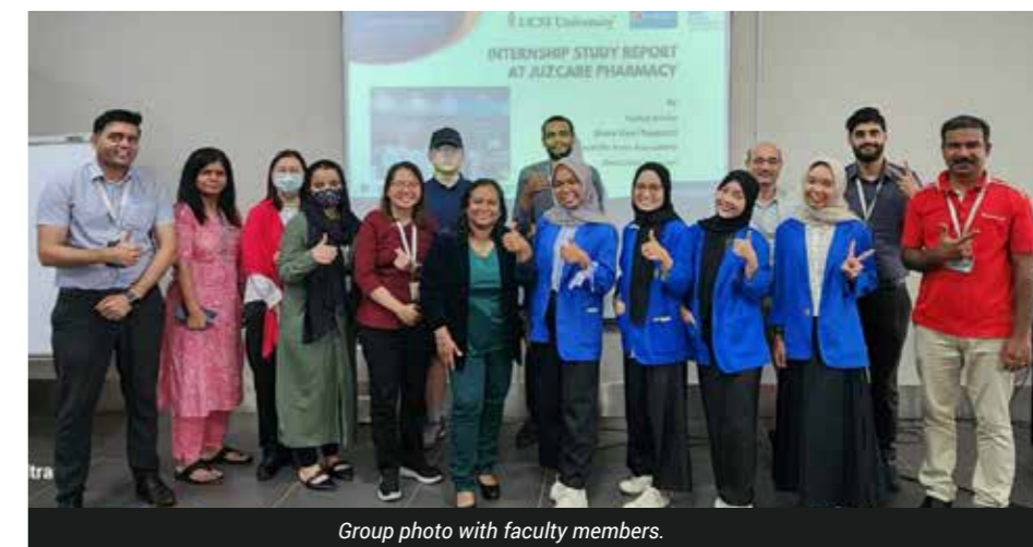
Group photo with faculty members.

the ongoing research projects of the PhD students. These sessions provided the students with a comprehensive understanding of how community pharmacies operate within the Malaysian healthcare system, the structure and expectations of the pharmacy internship programme, and insights into cutting-edge research being conducted by doctoral candidates at the university.