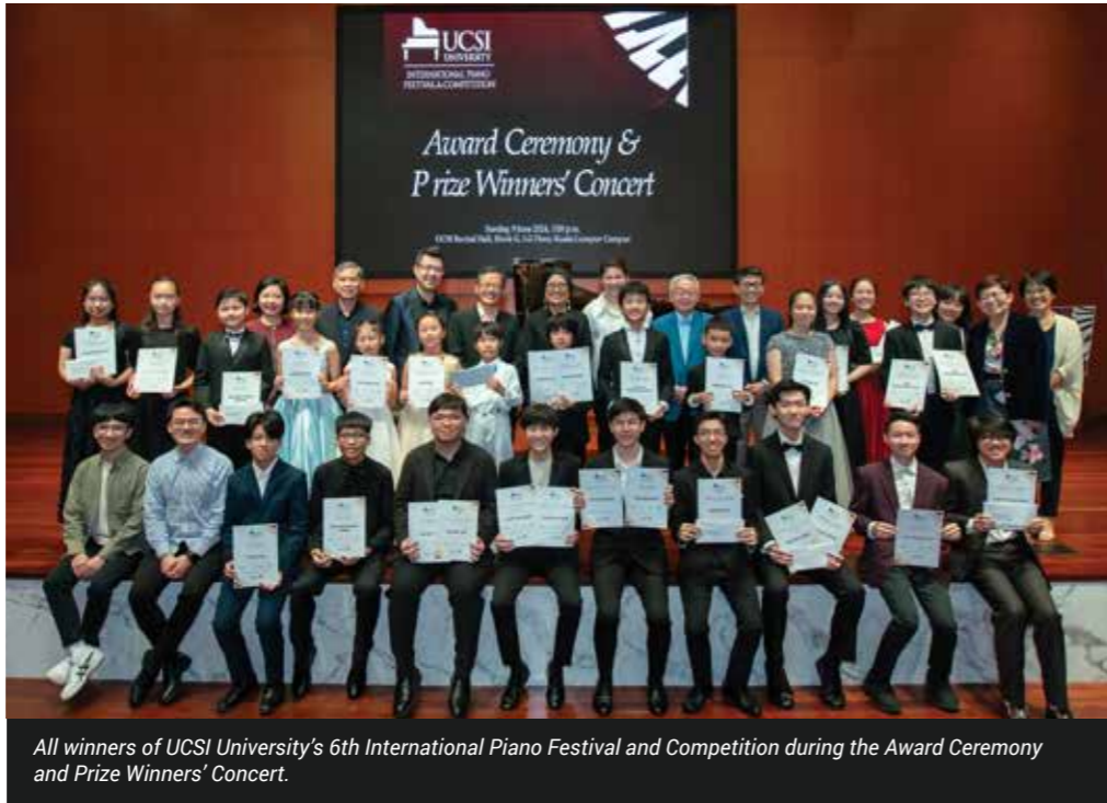
All winners of UCSI University's 6th International Piano Festival and Competition during the Award Ceremony and Prize Winners' Concert.