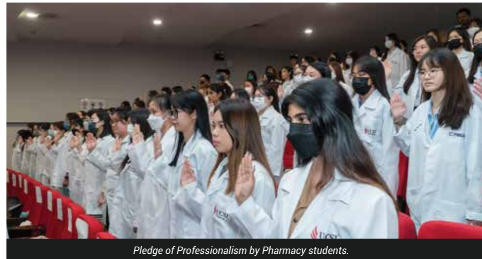
Pledge of Professionalism by Pharmacy students.