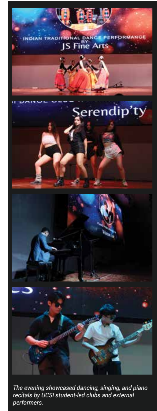
The evening showcased dancing, singing, and piano recitals by UCSI student-led clubs and external performers.

The night was filled with captivating performances, including a traditional Indian dance called "Kolattam" by JS Fine Art, a hip-hop dance performance by The Type X Clan, piano recitals by the talented Winson Lee, beautiful dance choreography by Serendip'ty of UCSI Dance Club and a lively performance by the UCSI H.O.T Band.