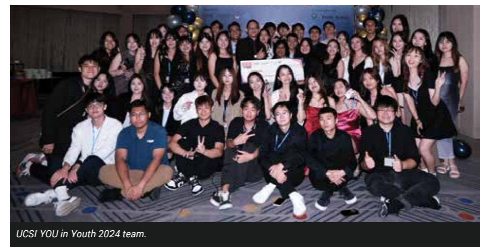
UCSI YOU in Youth 2024 team.

Furthermore, the partnership between UCSI University and SUKA Society exemplifies the spirit of SDG 17, which emphasises the need for multi-stakeholder collaboration to achieve sustainable development. By working together, academic institutions, non-profit organisations and the private sector can pool their resources, expertise, and networks to create lasting, positive impact in communities.