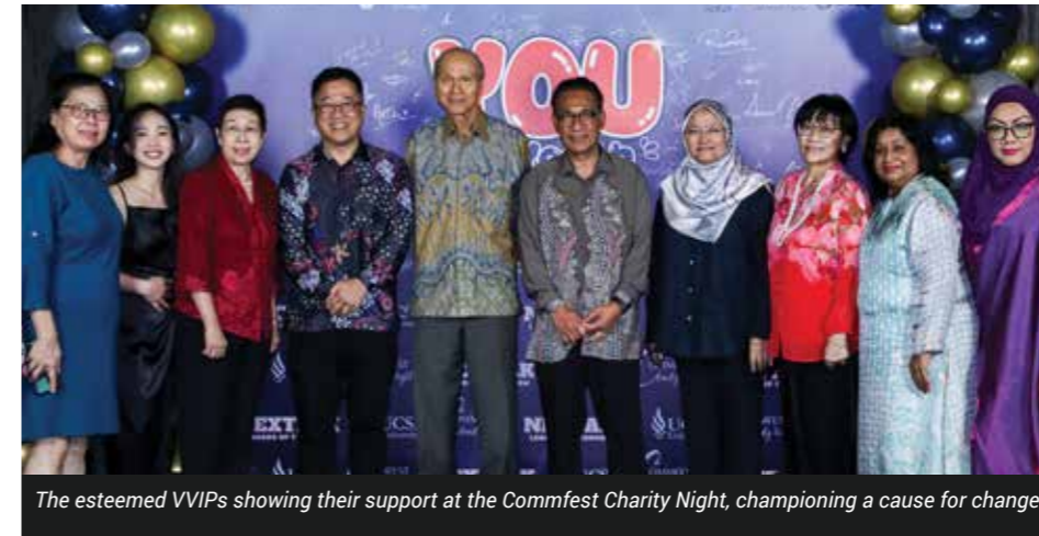
The esteemed VVIPs showing their support at the Commfest Charity Night, championing a cause for change.

UCSI YOU in Youth 2024 held a charity night in March as their second event in collaboration with SUKA society, a non-governmental organisation dedicated to protecting and preserving the best interests of marginalised and vulnerable children in Malaysia.