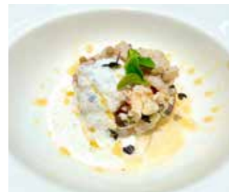
A traditional Malaysian dish featuring marinated shrimp, served with a light and airy coconut foam, finished with a drizzle of prawn oil