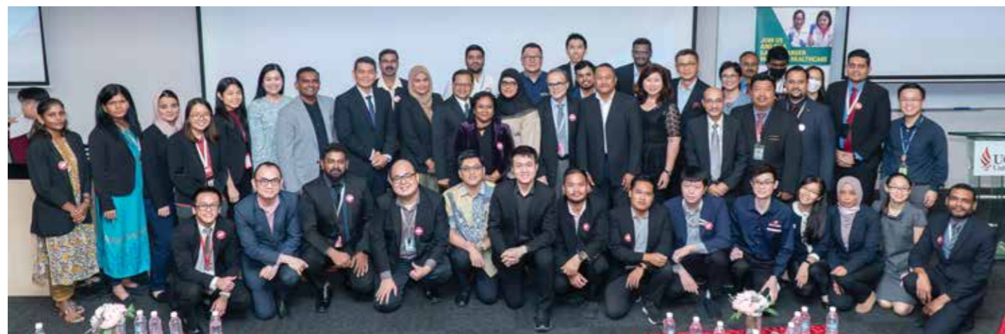
World Pharmacist Day and Formulation Scientists' Celebrations 2023 Group photo of the esteemed guests and organisation committee.