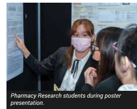
Pharmacy Research students during poster presentation.