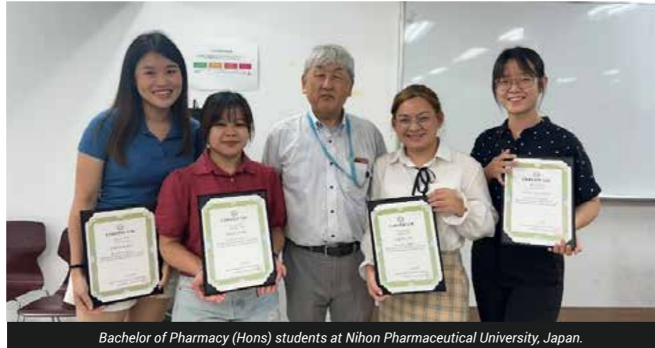
Bachelor of Pharmacy (Hons) students at Nihon Pharmaceutical University, Japan.

This programme aimed to provide our students with a comprehensive understanding of pharmaceutical education and practice within the Japanese healthcare system, while fostering interprofessional research collaboration.