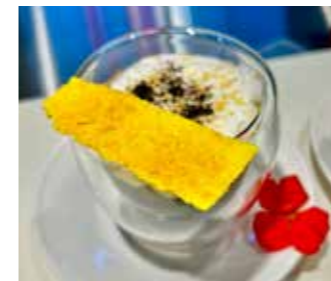
A sweet Malaysian dessert made with sago pearls cooked in palm sugar syrup, served with mango puree, diced mango pieces and topped with a light and fluffy coconut foam

Aiman's innovative dishes, which seamlessly blended local flavours with modern techniques, captivated the judges and earned him the prestigious gold medal.