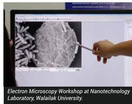
Electron Microscopy Workshop at Nanotechnology Laboratory, Walailak University.

Overall, this programme was a meaningful and enriching experience for the students. It provided them with the opportunity to work with people from different countries in an interactive and stimulating environment where everyone actively participated and shared constructive ideas, knowledge and experiences. This trip was not just educational but also a cultural exchange that broadened their horizons.